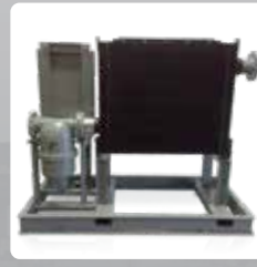
Aftercoolers & Separators