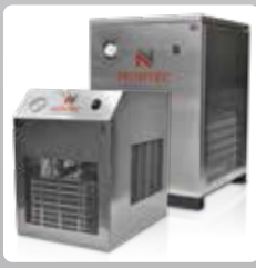
Refrigerated Compressed Air Dryers