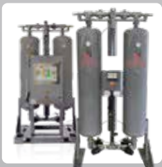
Regenerative Desiccant Compressed Air Dryers