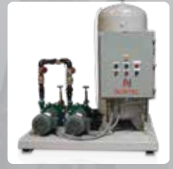
Closed Loop Fluid Cooler & Pumping Station