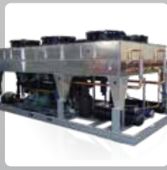
Industrial Process Chillers (5-500 Ton)